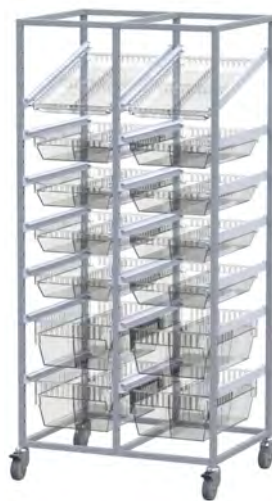
Transport Trolley 2 Section