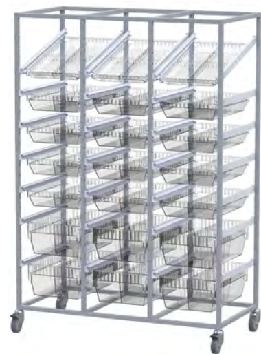
Transport Trolley 3 Section