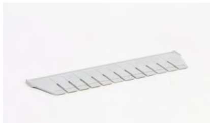
40 x 10cm | Light Grey TTT124010-11100