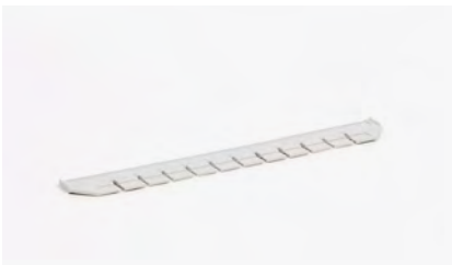
40 x 5cm | Light Grey TTT124005-11100