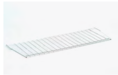
60 x 20cm | Transparent TTT126020-11100