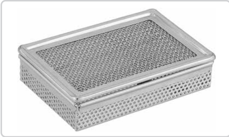
(Lid Wire Mesh)